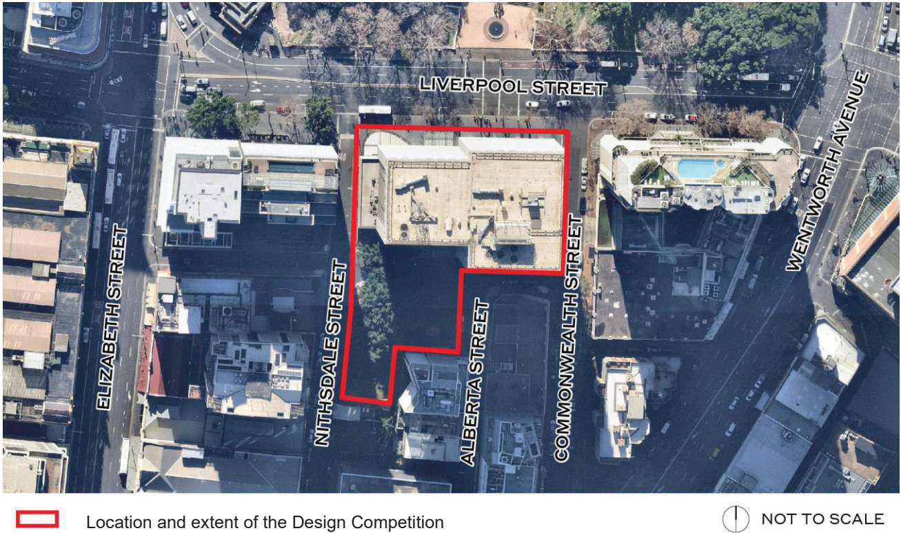
Figure 2 Site Context